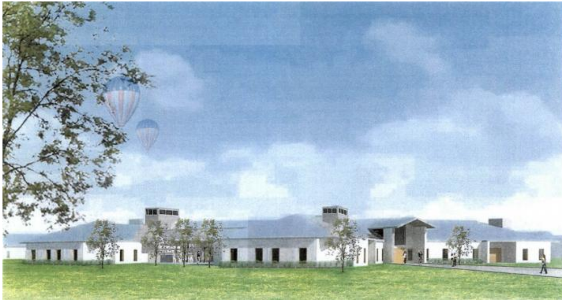
Ardie R Copas State Veterans Nursing Home Concept