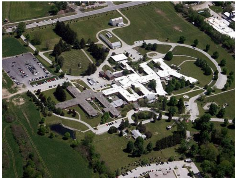
Overall Campus 2016

Visit the Vermont Office of Veterans Affairs website http://veterans.vermont.gov/ for contact information and benefits assistance.