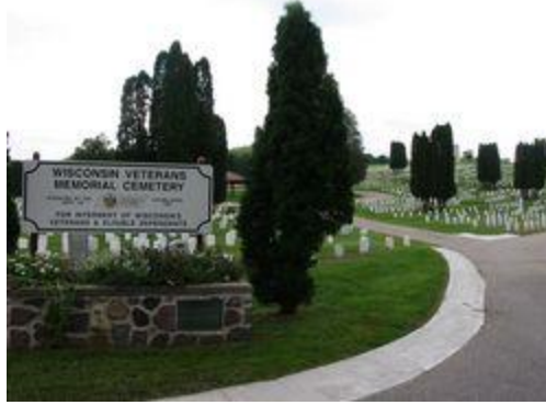
Central Wisconsin Veterans Memorial Cemetery N2665 Highway QQ, King, Waupaca County, Wisconsin 54946 Tel: (715) 256-3513 | Email: cwvmc@dva.wisconsin.gov