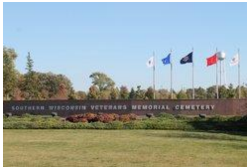
Southern Wisconsin Veterans Memorial Cemetery 21731 Spring St., Union Grove, Racine County, Wisconsin 53182 Tel: (262) 878-5660 | Email: swvmc@dva.wisconsin.gov