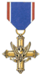
Distinguished Service Cross Medal