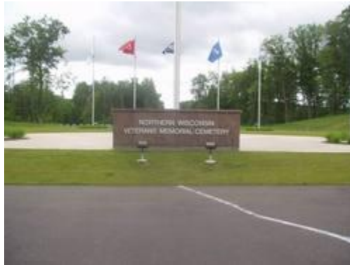
Northern Wisconsin Veterans Memorial Cemetery N4063 Veterans Way, Spooner, Washburn County, Wisconsin 54801 Tel: (715) 635-5360 | Email: nwvmc@dva.wisconsin.gov