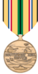
Persian Gulf War Veteran