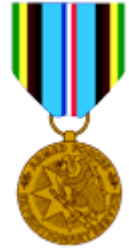
Somalia War Veteran