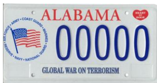
Global War on Terrorism