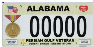
Desert Shield / Desert Storm