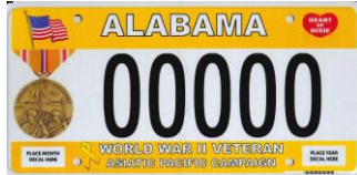
WWII Asiatic Campaign