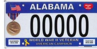
WWII American Campaign