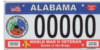
Battle of the Bulge