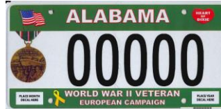
WWII European Campaign

Visit the Alabama State VA website http://www.va.state.al.us/default.aspx to get more details and learn how to apply for veteran benefits. [Source: http://www.military.com/benefits/veteran-state-benefits/alabama-state-veterans-benefits.html?comp=7000022835803&rank=2 Jul 2014 ++]