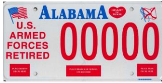
US Armed Forces Retired (Retired Military)