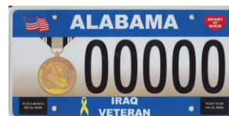
Operation Iraqi Freedom