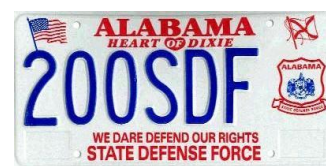
Alabama State Defense