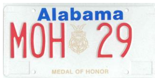
Medal of Honor