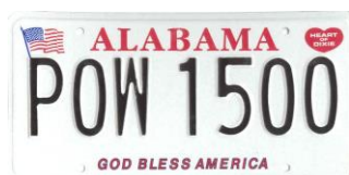
Prisoner of War