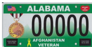
Operation Enduring Freedom - Afghanistan