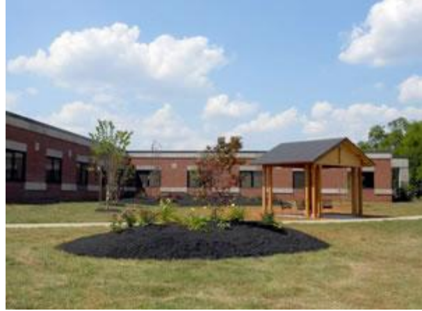
Tennessee State Veterans' Home 345 Compton Road Murfreesboro, TN 37130 (615) 895-8850