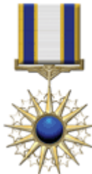
Air Force Distinguished Service Medal