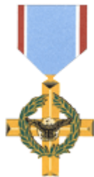
Air Force Cross Medal