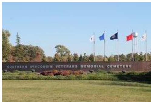
Southern Wisconsin Veterans Memorial Cemetery 21731 Spring St., Union Grove, Racine County, Wisconsin 53182 Tel: (262) 878-5660 | Email: swvmc@dva.wisconsin.gov