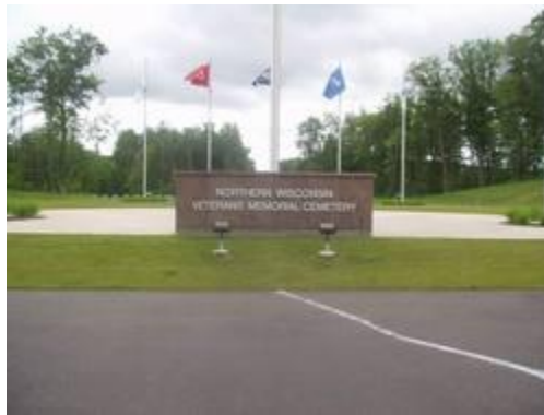
Northern Wisconsin Veterans Memorial Cemetery N4063 Veterans Way, Spooner, Washburn County, Wisconsin 54801 Tel: (715) 635-5360 | Email: nwvmc@dva.wisconsin.gov