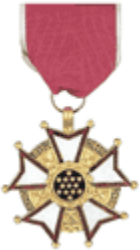
Legion of Merit Medal