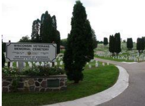
Central Wisconsin Veterans Memorial Cemetery N2665 Highway QQ, King, Waupaca County, Wisconsin 54946 Tel: (715) 256-3513 | Email: cwvmc@dva.wisconsin.gov

Upon meeting eligibility standards, veterans are provided a burial at no cost, spouses and dependent children will incur a burial fee. For a Brochure covering all the Wisconsin veteran cemeteries go to http://dva.state.wi.us/WebForms/WDVA_B0145_Wis_Veterans_Memorial_Cemeteries_forWeb.pdf